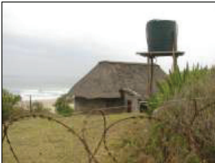
Photograph 3: Structure located at S32°03'45.6" E29°05'11.8"