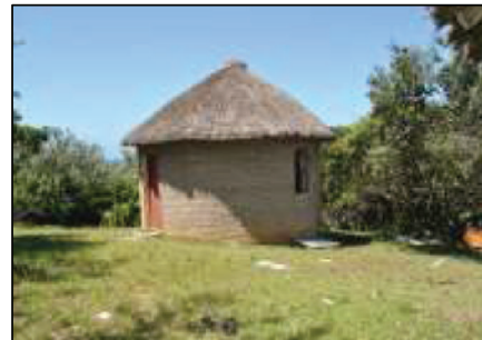
Photograph 4: Structure located at S32°20'19.78" E28°47'31.36"