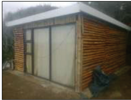
Photograph 5: Structure located at S31°28'19.8" E29°44'09.2"

It is this Department's view evidenced by thorough investigations that the structures at the following coordinates, S32°03'53.2" E29°05'12.8", S32°03'57.6" E29°05'10.3, S32°03'45.6" E29°05'11.8" and S32°20'19.78" E28°47'31.36" were constructed unlawfully and have subsequently been abandoned. The structure constructed at the following coordinates S31°28'19.8" E29°44'09.2" is a recent construction. The person/s responsible for the structures cannot be found.