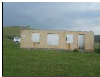
Photograph 2: Structure located at S32°03'57.6" E29°05'10.3"