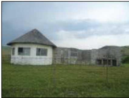
Photograph 1: Structure located at S32°03'53.2" E29°05'12.8"

The Department of Economic Development, Environmental Affairs and Tourism hereby give notice of its intention to demolish abandoned structures within the coastal zone at the following co-ordinates S32°03'53.2" E29°05'12.8", S32°03'57.6" E29°05'10.3", S32°03'45.6" E29°05'11.8", S32°20'19.78" E28°47'31.36" and S31°28'19.8" E29°44'09.2" in terms of Section 60 of the National Environmental Management: Integrated Coastal Management Act, 2008 (Act 24 of 2008) (ICMA) after the 15 August 2015.