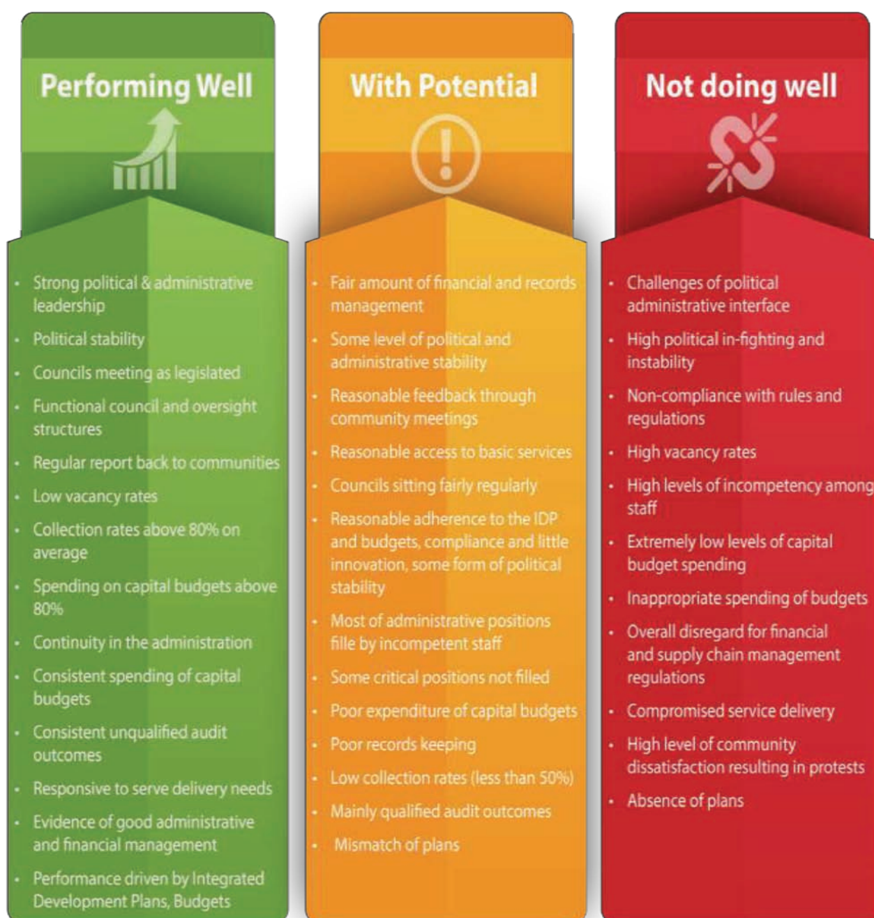
FIGURE 1: CATERGORISATION OF MUNICIPALITIES

At the onset of the Back to Basics Programme, municipalities have been categorised as Performing Well (Functional), With Potential (Challenged) and Not Doing Well (Requiring Intervention). The Performing Well Category is a defined notion of an ideal municipality, and the content of an acceptable level of performance.