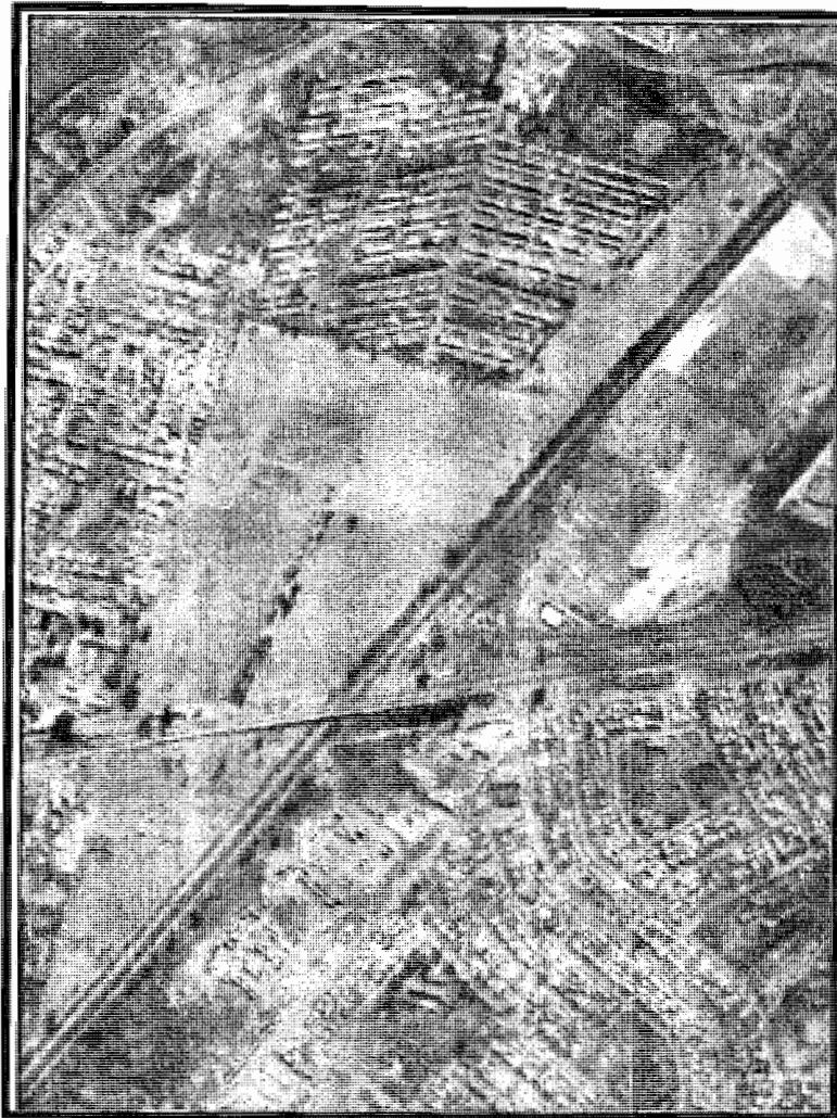
Figure 2: Locality plan for Nancefield (Klipspruit) Cemetery where Charlotte Maxeke is buried