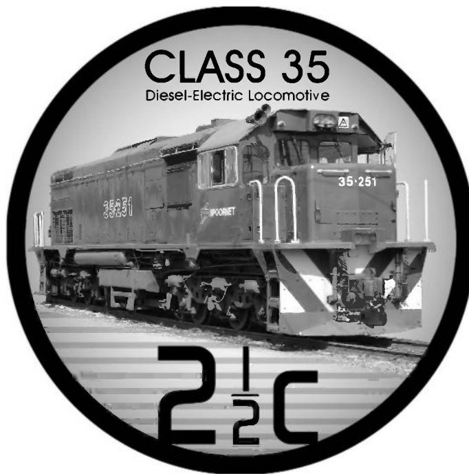
Reverse - 2 1/2 c Tickey Sterling Silver Coin