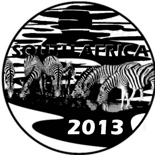
Obverse - Natura Series