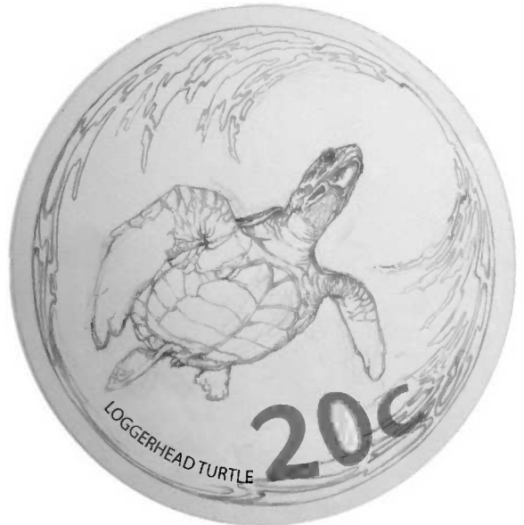
Reverse - 20c (1oz) Sterling Silver Coin