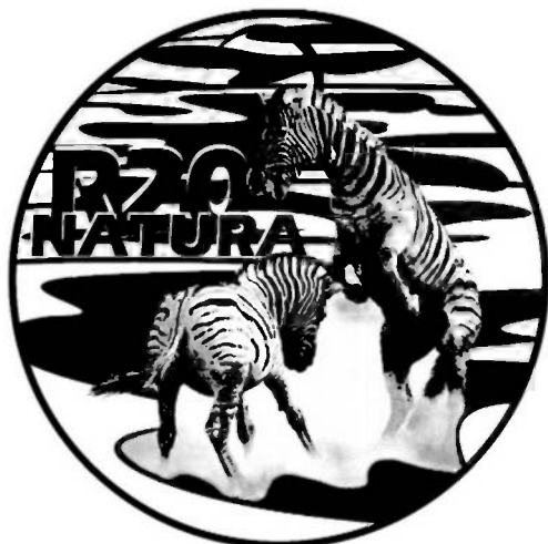
Reverse - R20 (1/4 oz) 24ct Gold Natura Coin