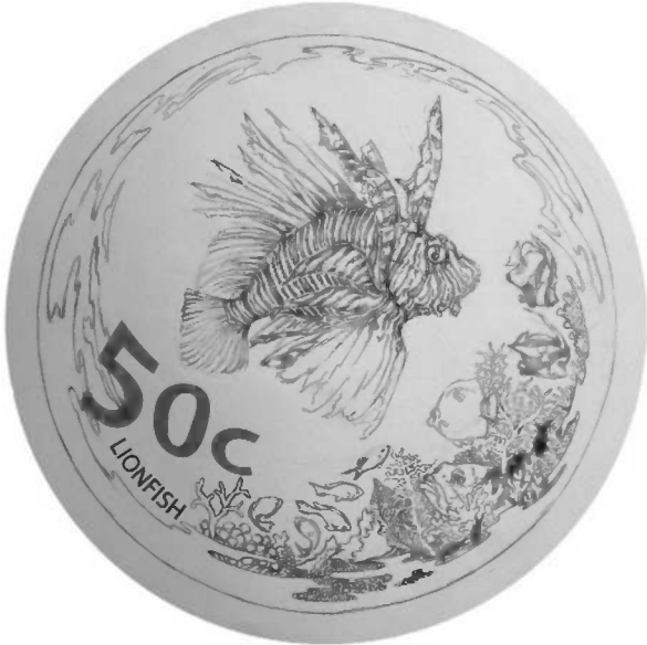
Reverse - 50c (2oz) Sterling Silver Coin