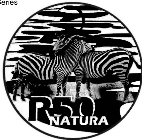
Reverse - R50 (1/2 oz) 24ct Gold Natura Coin