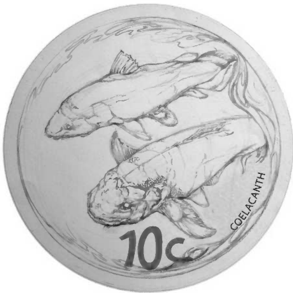
Reverse - 10c (1/2 oz) Sterling Silver Coin