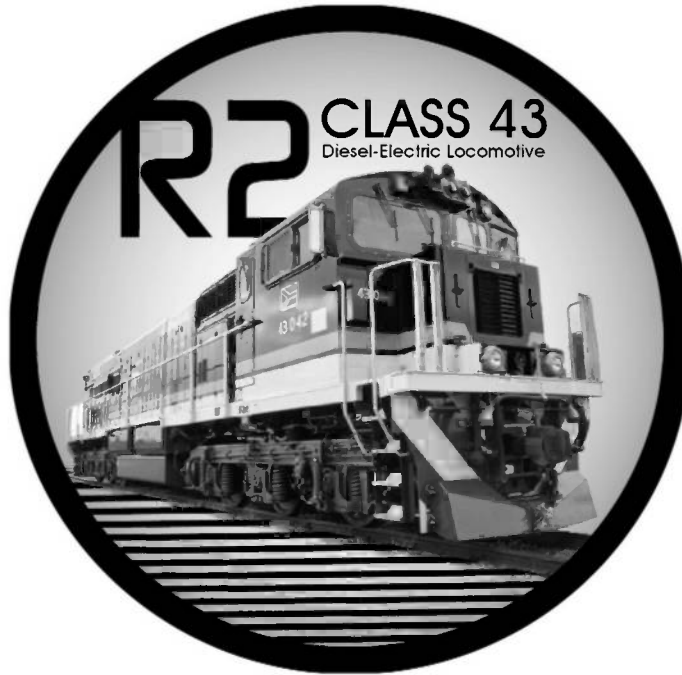
Reverse - R2 Crown Sterling Silver Coin