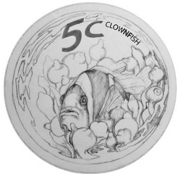
Reverse - 5c (1/4 oz) Sterling Silver Coin