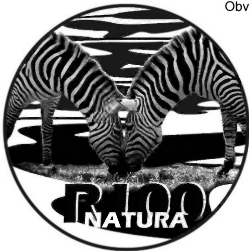
Reverse - R100 (1oz) 24ct Gold Natura Coin