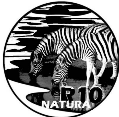
Reverse - R10 (1/10 oz) 24ct Gold Natura Coin