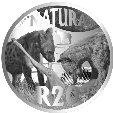
Reverse: R20 (1/4oz, Au 999.9)