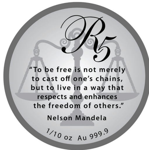
Reverse: R5 (1/10oz, Au 999.9)