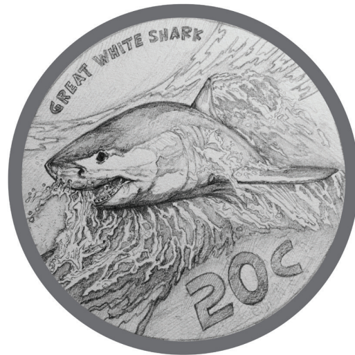
Reverse: 20c (1oz, Ag 925 Cu 75)