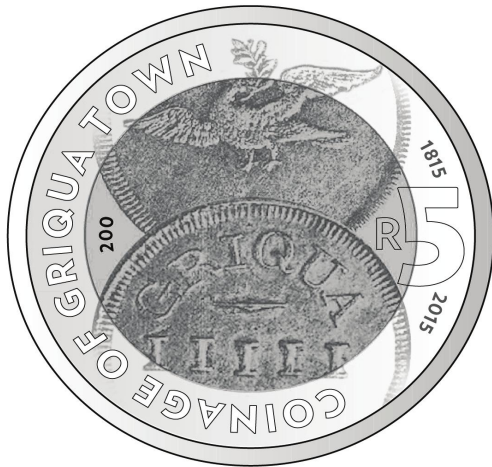
Reverse: R5 circulation coin