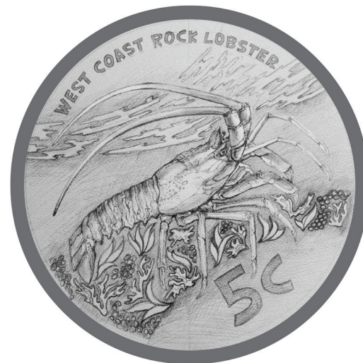
Reverse: 5c (1/4oz, Ag 925 Cu 75)