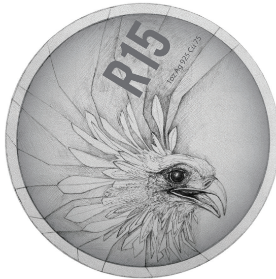
Reverse: R15 (1oz, Ag 925 Cu 75)