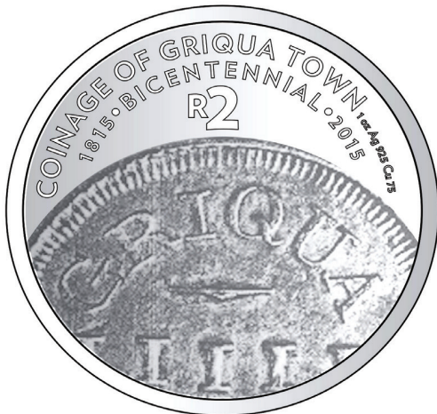
Reverse: R2 (1oz, Ag 925 Cu 75)