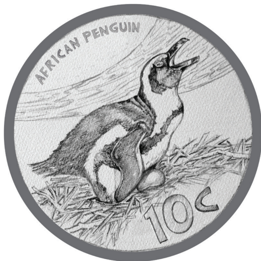
Reverse: 10c (1/2oz, Ag 925 Cu 75)