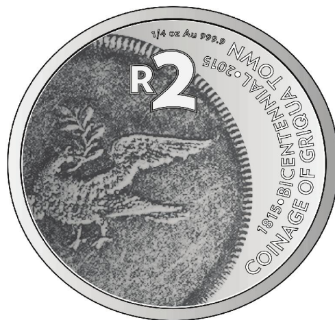
Reverse: R2 (1/4oz, Au 999.9)