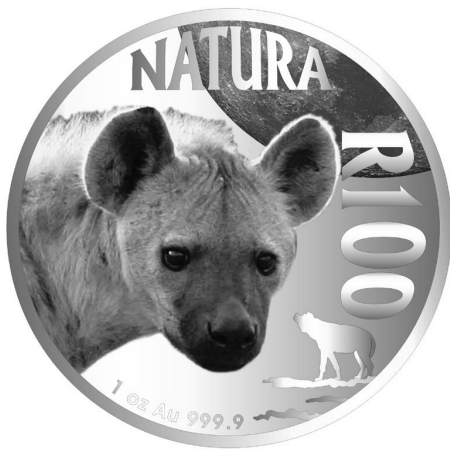
Reverse: R100 (oz, Au 999.9)