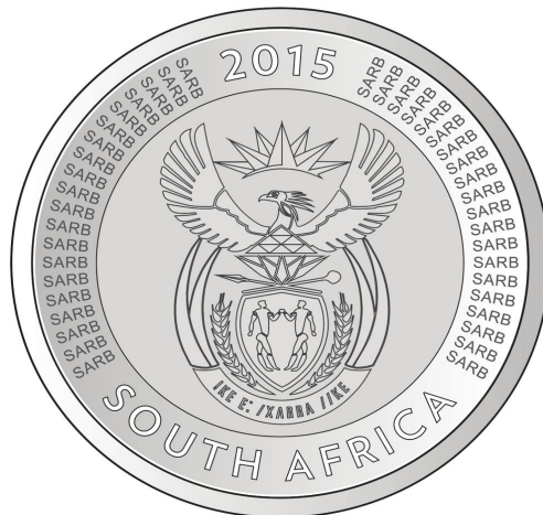
Obverse: R5 circulation coin