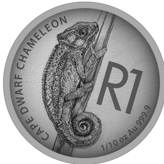
Reverse: R1 (1/10oz, Au 999.9)