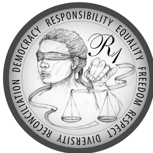
Reverse: R1 (Ag 925, Cu 75)