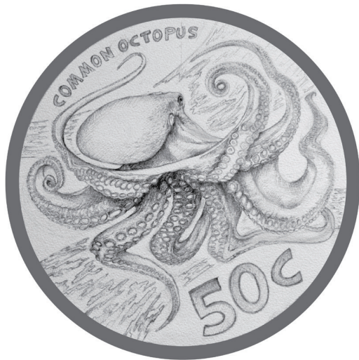
Reverse: 50c (2oz, Ag 925 Cu 75)