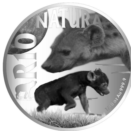
Reverse: R10 (1/10oz, Au 999.9)