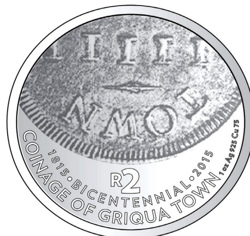
Reverse: R2 (1oz, Ag 925 Cu 75)