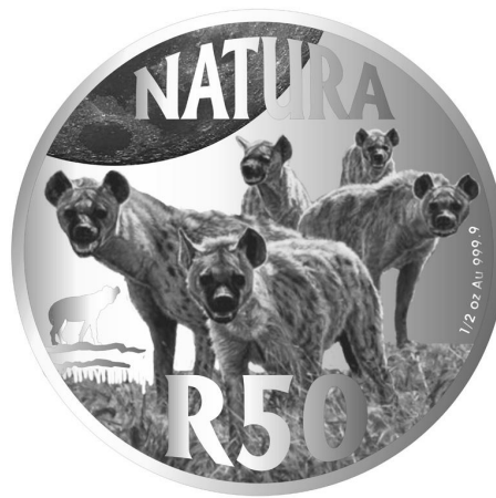
Reverse: R50 (1/2oz, Au 999.9)