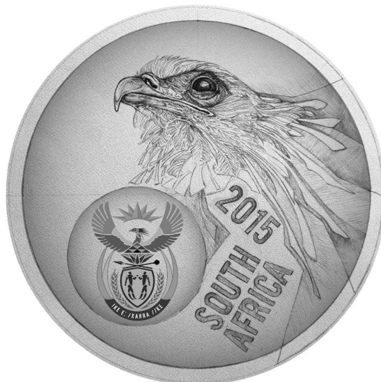
Obverse: R15 (1oz, Ag 925 Cu 75)