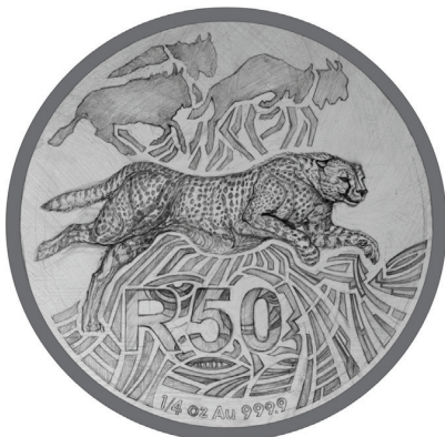
Reverse: R50 (1/4oz, Au 999.9)