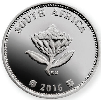
Obverse: 2 1/2 c Tickey (Ag 925 Cu 75)