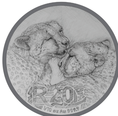
Reverse: R20 (1/10oz, Au 999.9)