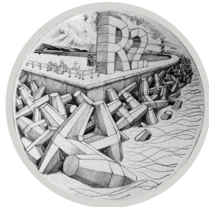
Reverse: R2 Crown (1oz, Ag 925 Cu 75)