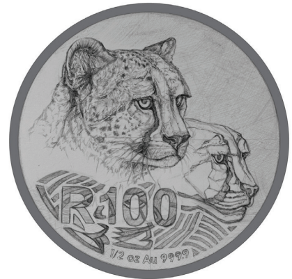
Reverse: R100 (1/2oz, Au 999.9)