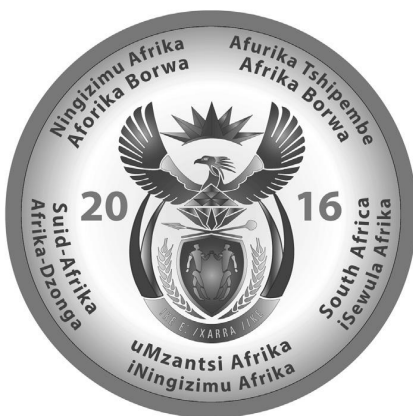
Obverse: R2 (1oz, Ag 925 Cu 75)