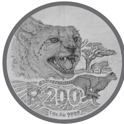
Reverse: R200 (1oz, Au 999.9)