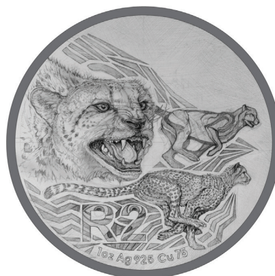
Reverse: R2 (1oz, Ag 925 Cu 75)