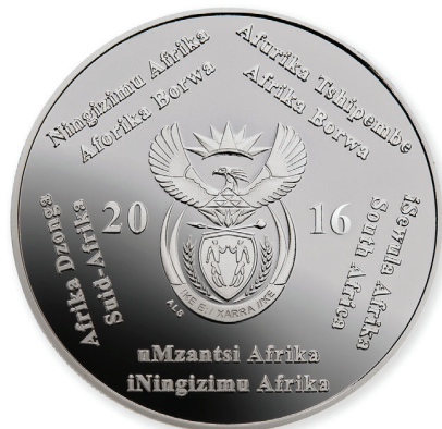
Obverse: R2 Crown (1oz, Ag 925 Cu 75)