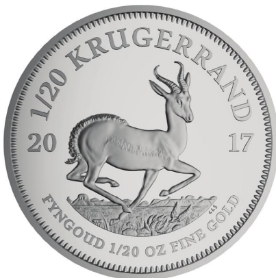
Reverse: 1/20oz, Au 916.67 Cu 83.33