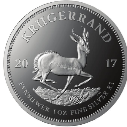
Reverse: 2017 1oz Krugerrand (Ag 999)