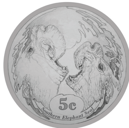
Reverse: 5c (1/4oz, Ag 925 Cu75)