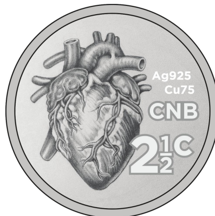
Reverse: 2 1/2 c Tickey (Ag 925 Cu 75)