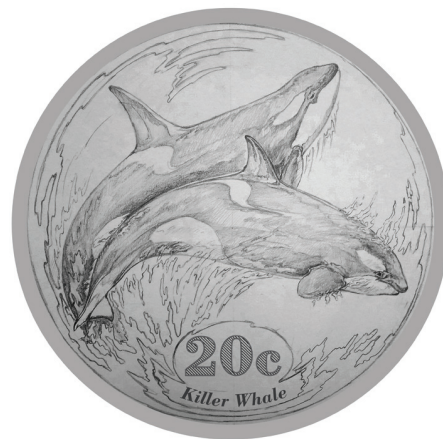
Reverse: 20c (1oz, Ag 925 Cu75)