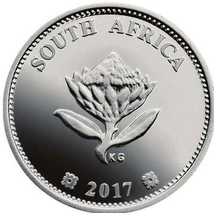
Obverse: 2 1/2 c Tickey (Ag 925 Cu 75)