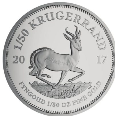
Reverse: 1/50oz, Au 916.67 Cu 83.33