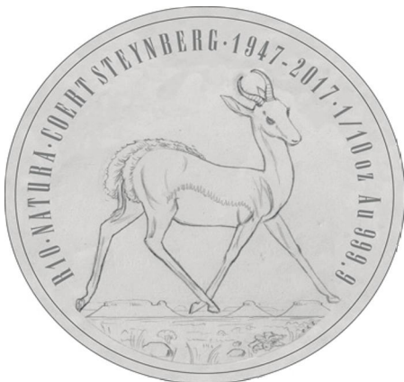
Reverse: R10 (1/10oz, Au 999.9)