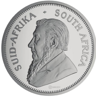
Obverse: 1967/2017 Vintage 1oz (Au 916.67 Cu 83.33)