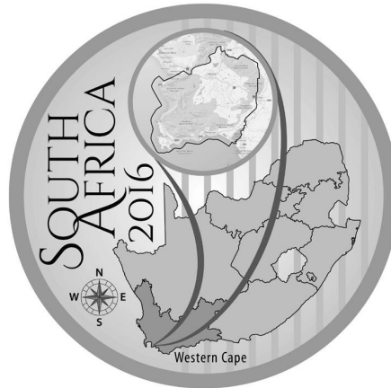
Common obverse (2x R5 1oz, and 2x R10 1oz)