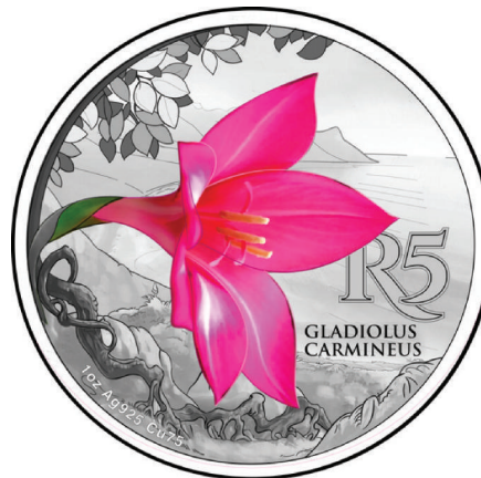
Reverse: R5 (1oz, Ag 925 Cu 75)