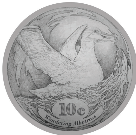
Reverse: 10c (1/2oz, Ag 925 Cu75)