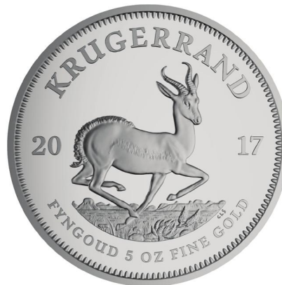
Reverse: 5oz, Au 916.67 Cu 83.33