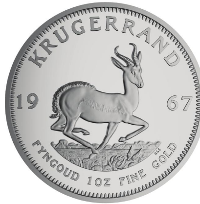
Reverse: 1967/2017 Vintage 1oz (Au 916.67 Cu 83.33)