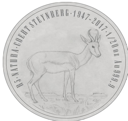
Obverse: R5 (1/20oz, Au 999.9)