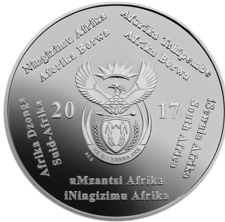
Obverse: R2 Crown (1oz, Ag 925 Cu 75)