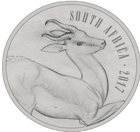
Common obverse (1oz, 1/2oz, 1/4oz, 1/10oz and 1/20oz)