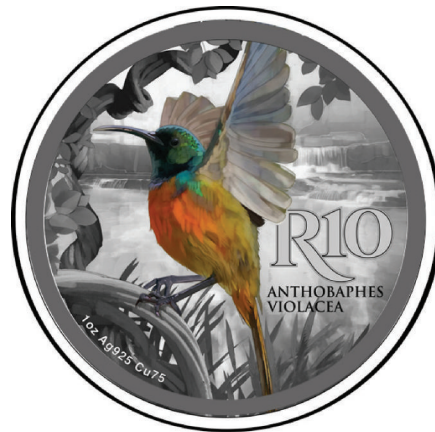
Reverse: R10 (1oz, Ag 925 Cu 75)