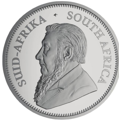
Common obverse of the 22-carat gold Krugerrands