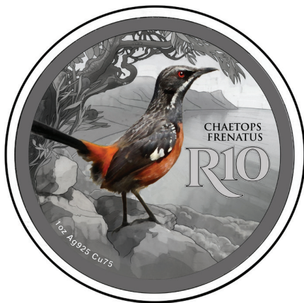
Reverse: R10 (1oz, Ag 925 Cu 75)