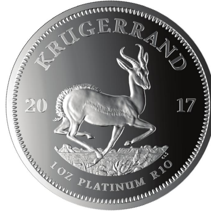
Reverse: 2017 1oz Krugerrand (PI 999.9)