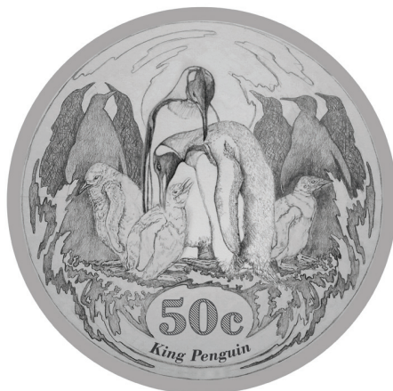
Reverse: 50c (2oz, Ag 925 Cu75)