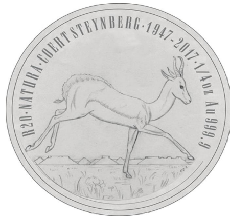
Reverse: R20 (1/4oz, Au 999.9)