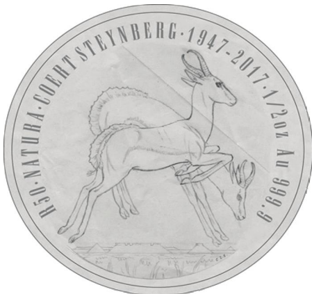
Reverse: R50 (1/2oz, Au 999.9)