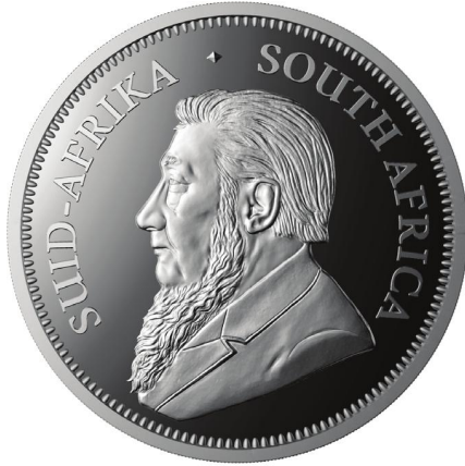
Obverse: 2017 1oz Krugerrand (Ag 999)