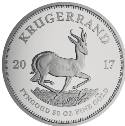
Reverse: 50oz, Au 916.67 Cu 83.33