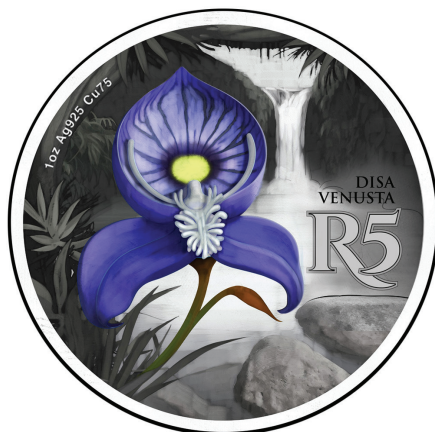
Reverse: R5 (1oz, Ag 925 Cu 75)