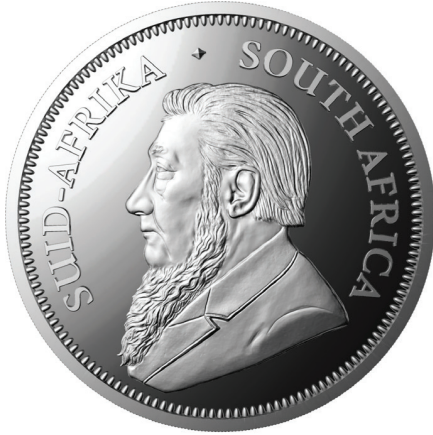
Obverse: 2017 1oz Krugerrand (PI 999.9)