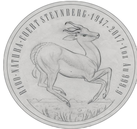
Reverse: R100 (1oz, Au 999.9)