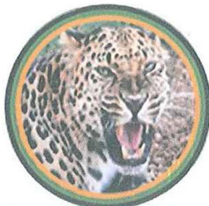
NATIVE TRIBAL INDIGENOUS MOVEMENT