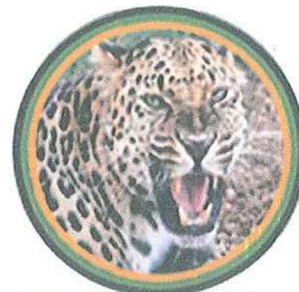
NATIVE TRIBAL INDIGENOUS MOVEMENT