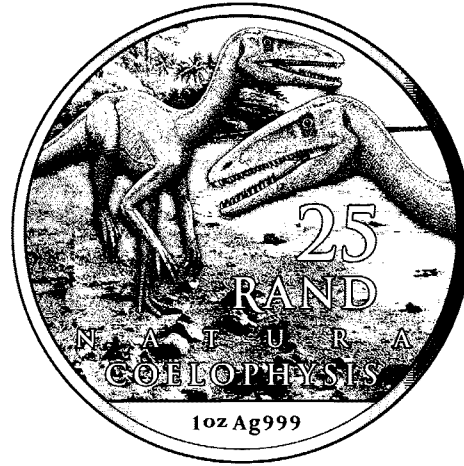
Reverse: R25 (1oz, Ag 999)