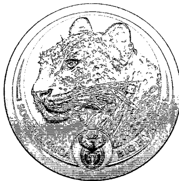
Obverse: R5 (1oz, Ag 999)

We would like to inform you that an error was published in the government gazette of 22 March 2019. The description below the coin designs of the 'Africa's Big 5' platinum series feature R50 as the denomination. The denomination for the platinum range is R20 or TWENTY RAND as featured on the coins.