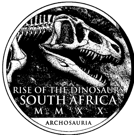
Obverse: R25 (1oz, Ag 999)