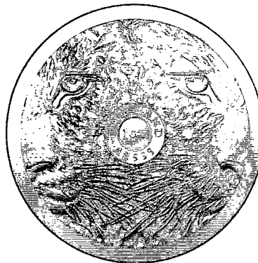
Reverse: R5 (1oz, Ag 999)