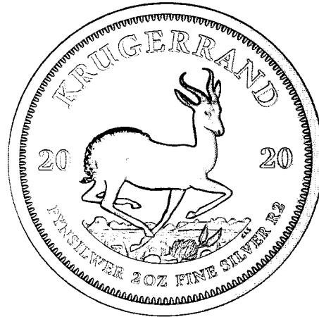
Reverse: R2 (2oz, Ag 999)