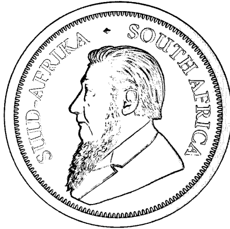
Obverse: R2 (2oz, Ag 999)